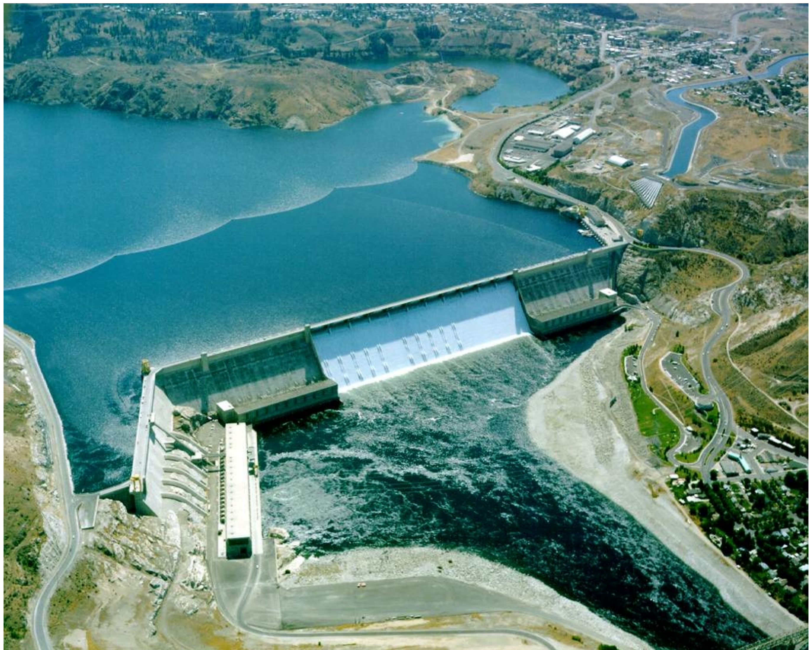
U.S. Bureau of Reclamation, USA Grand Coulee Dam, 4 HPPs, 6800 MW